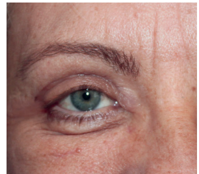
Patient 2 - 1 week after surgery