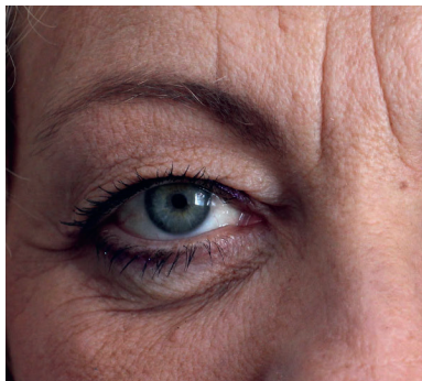
Patient 2 - Before surgery