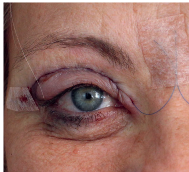
Patient 2 - Immediately after surgery